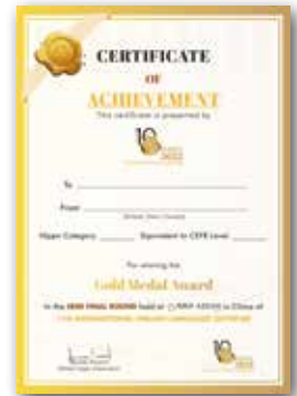
Certificate of Achievement

Both certificate will identify the CEFR level that corresponds to the participant's level of entry.