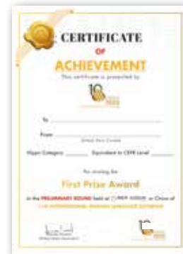
Certificate of Achievement (Sample)

Both certificates will identify the CEFR level that corresponds to the participant's level of entry.