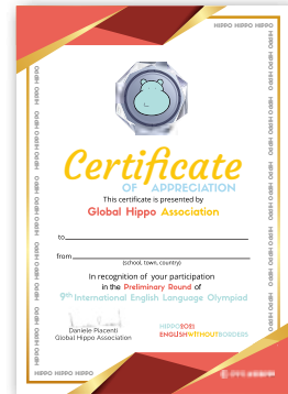
Certificate of Participation (Sample)

*All contestants will receive a certificate of participation from the HIPPO committee